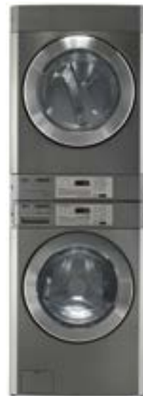
Washer & Dryer Stack Type (Coin, Card/OPL)