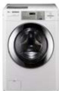
Card / OPL Type