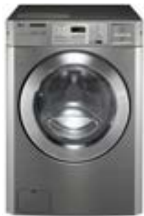
Card / OPL Type