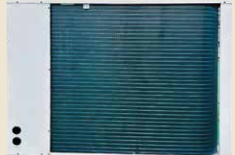
Anti-Corrosion Blue Coating on the Fin

LG's "Blue Fin" heat exchanger is designed for long-lasting performance, even in harsh and corrosive environments. The anti-corrosive Blue coating shields it from corrosion caused by external environmental conditions, and the hydrophilic film helps prevent water buildup, minimizing moisture. This enhances durability, allowing the product to last longer while keeping maintenance and running costs low.