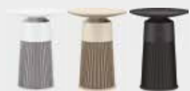
AS20GPHK0 & AS20GPBK0 & AS20GPKK0 Essence White, Clay Brown, Graphite